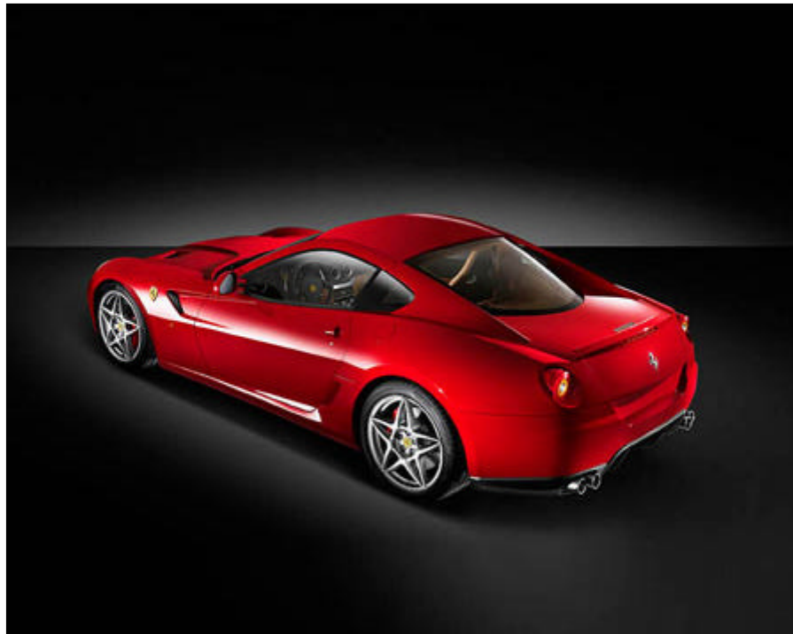
Click here to zoom.