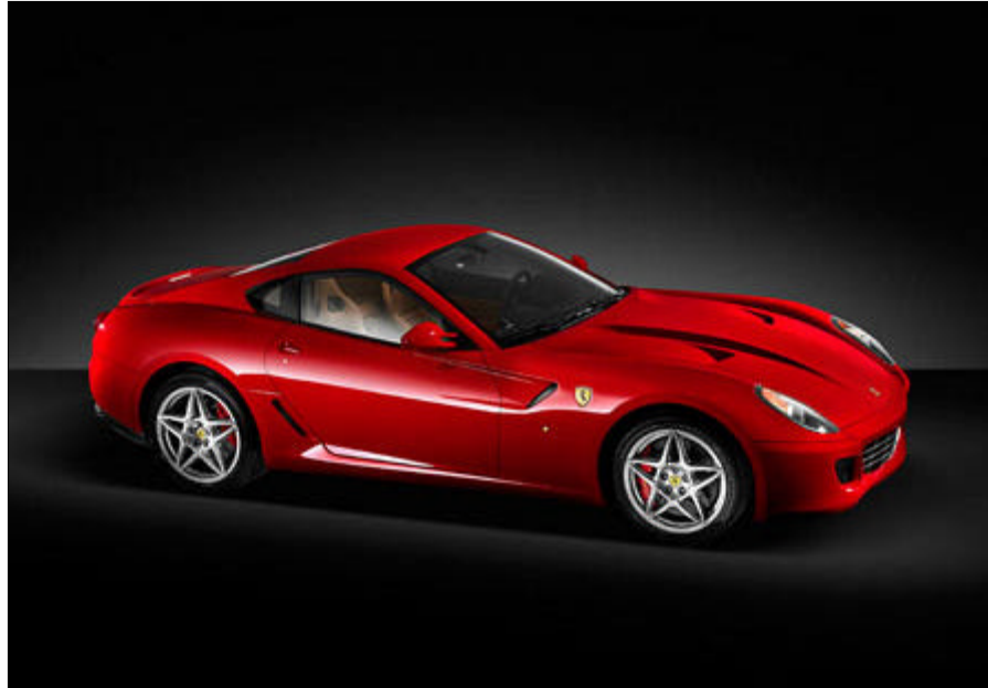
Click here to zoom.