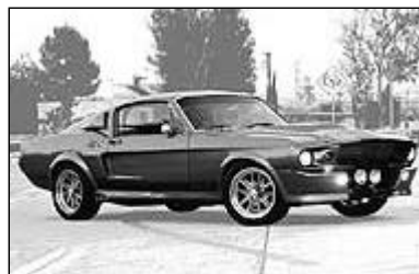
If you want your Mustang to look like a movie star, this body package is designed to fit '67-'68 fastbacks and coupes (upper side scoops for fastbacks only).