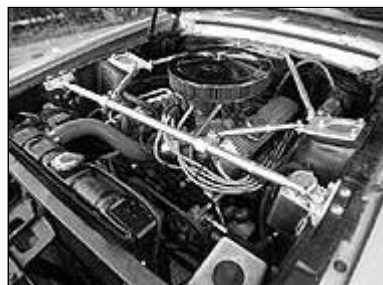
The car has muscle with its stroked 347-cid Ford that's topped by an Edelbrock 650-cfm carb and Performer intake. The 351W heads have been ported and polished.