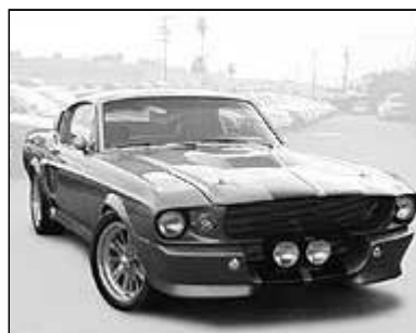
Eleanor is not just another pretty face—she took 60 hours for prep and paint (DuPont Enamel Pepper Gray Metallic No. 44490 with Black Metallic No. 44435 strips) to get that movie-star