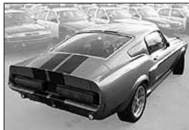
To take the flex out of the chassis, subframe connectors were bolted underneath. These are designed to reduce chassis twist by linking the car's sub-frames together, creating a unified structure.