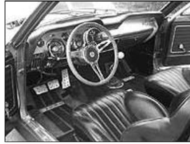
What started out as a '67 Shelby Mustang now has a new interior look as well, with upgraded tach and dash.