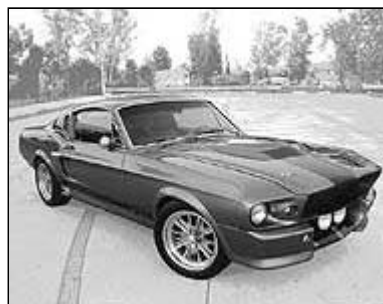
Working from his renderings, Chip Foose designed a more muscular shape for this Mustang, with fender flares, a new hood and front fascia with PIAA driving lights, side skirts with exhaust tips, scoops, and a modified tail piece.

The car also has the right rumble, courtesy of Brian Saklad at Dyno-Flo, who stroked the 302 to 347 cid with SCAT rods and crank. He topped the block with an Edelbrock 650-cfm carb and Performer intake, and the 351W heads have been ported and polished. Saklad also added the Total Control